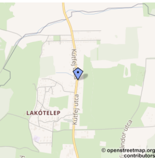
Village Info Kútfej